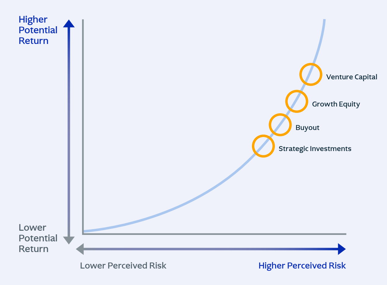
EXHIBIT 2 | The Private Equity Investment Spectrum

When investors decide to invest in private equity, they can choose from a variety of strategies (Exhibit 2).